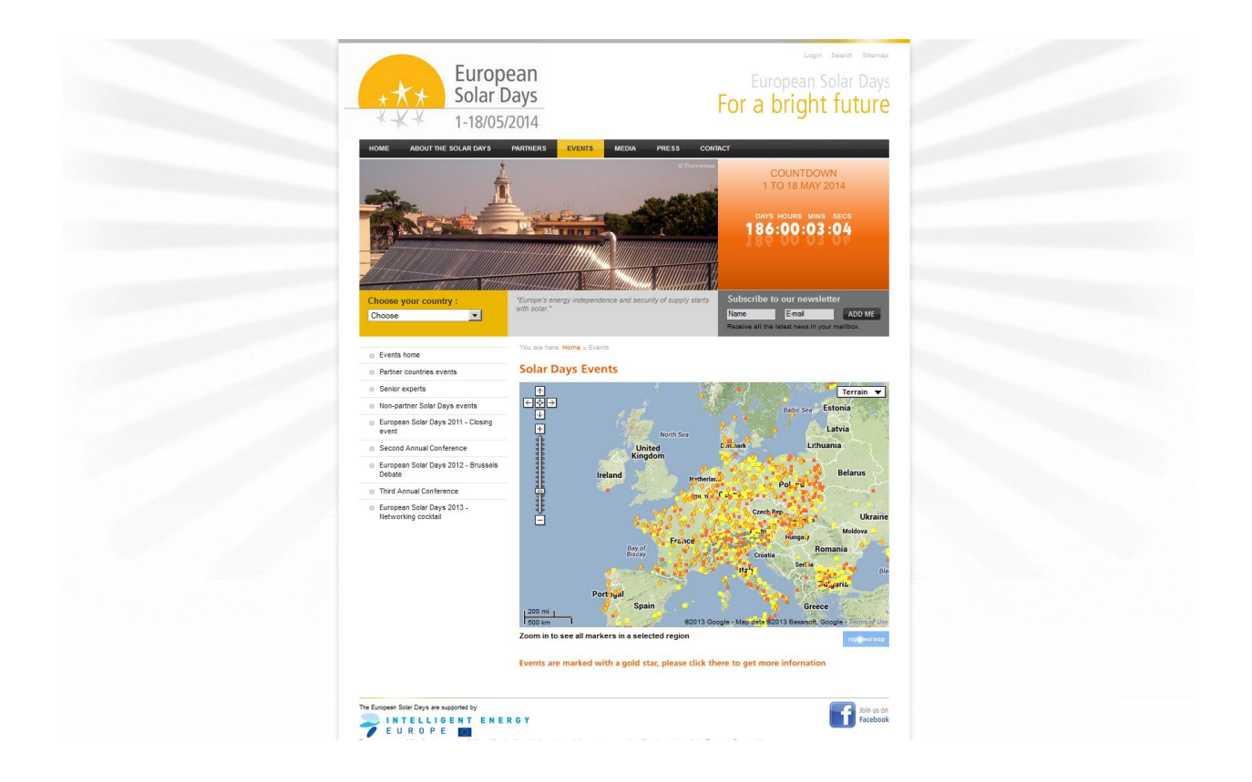
Figure 1: Screenshot of the website of the European Solar Days with events from 2013.

The following screenshot shows the map of the European Solar Days events shown on the European Solar Days website.