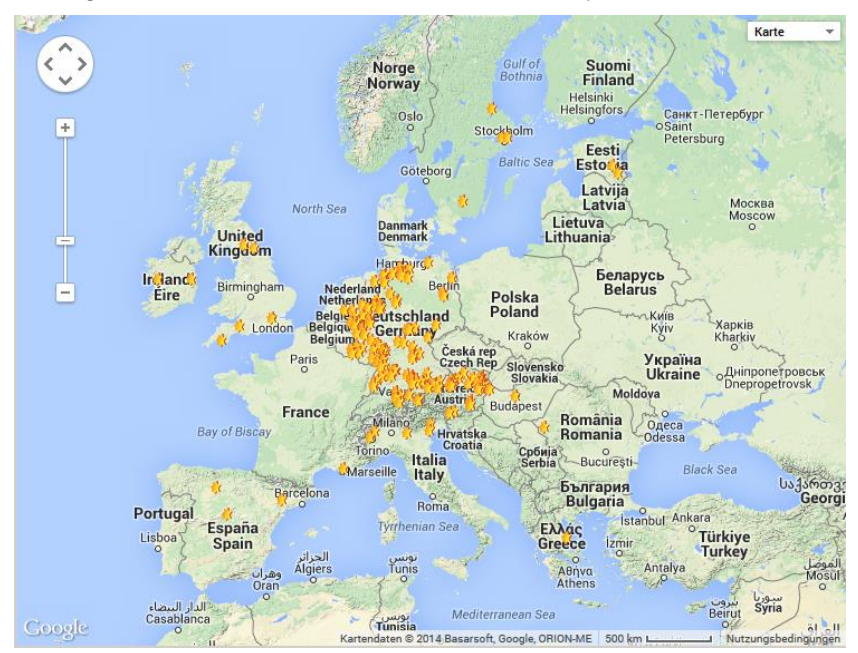
Figure 6: Screenshot showing distribution of events on the map during Passive House Days 2014

The following screenshot shows the distribution of events shown on the map during the International Passive House Days 2014: