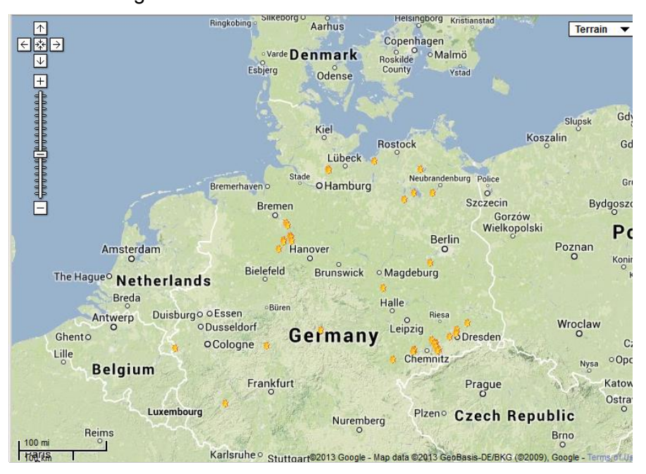
Figure 4: Screenshot of the map showing events related to the campaign "Tag der erneuerbaren Energien".

The following screenshot shows the distribution of locations where site visits are offered throughout 2013 within the framework of the campaign "Tag der erneuerbaren Energien":