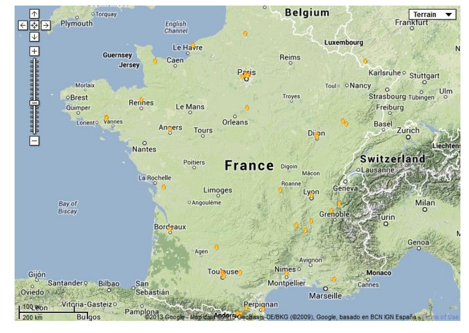
Figure 2: Screenshot of the map showing events related to the campaign "Journées de l'Energie" 2013.

The following screenshot shows the distribution of locations of the campaign "Journées de l'Energie" 2013 organized by CLER: